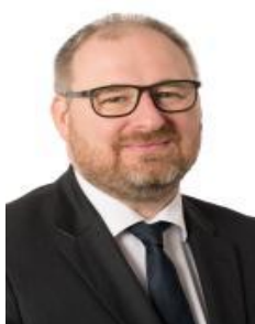
Mr Ronan LE GLEUT

Member of the Foreign Affairs, Defence and Armed Forces Committee Group of the Progressive Alliance of Socialists and Democrats (S&D)