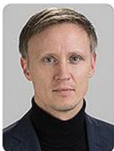
Mr Rihards KOLS

Head of delegation Chair of the Foreign Affairs Committee European Conservatives and Reformists Group (ECR)