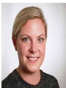
Ms Merete SCHEELSBECK

Head of delegation Member of the Foreign Affairs Committee and European Affairs Committee Group of the European People's Party (Christian Democrats) (EPP)