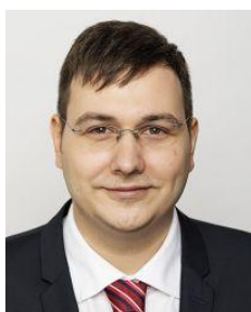
Mr Jan LIPAVSKÝ

Head of delegation Chair of the Foreign Affairs Committee Group of the Progressive Alliance of Socialists and Democrats (S&D)