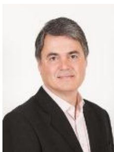
Mr Carlos ROJAS

Head of delegation to the Inter-Parliamentary Conference for the Common Foreign and Security Policy (CFSP) and the Common Security and Defence Policy (CSDP) Group of the European People's Party (Christian Democrats) (EPP)