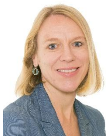
Ms Anniken HUITFELDT

Chair of the Standing Committee on Foreign Affairs and Defence Group of the Progressive Alliance of Socialists and Democrats (S&D)