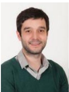
Mr Pablo BUSTINDUY

Head of delegation to the Inter-Parliamentary Conference for the Common Foreign and Security Policy (CFSP) and the Common Security and Defence Policy (CSDP) Group of the European People's Party (Christian Democrats) (EPP)