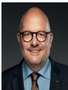
Mr Marc ANGEL

Head of delegation Chair of the Homeland Security and Defence Committee Group of the Greens/European Free Alliance (Greens/EFA)