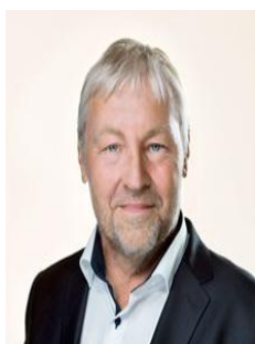
Mr Villum CHRISTENSEN

Head of delegation Member of the Foreign Affairs Committee and European Affairs Committee Group of the European People's Party (Christian Democrats) (EPP)