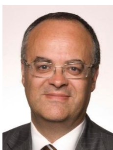
Mr Vitalino CANAS

Chair of the National Defence Committee Group of the European People's Party (Christian Democrats) (EPP)