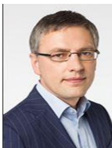
Mr Vytautas BAKAS

Member of Committee on Foreign Affairs Group of the European People's Party (Christian Democrats) (EPP)