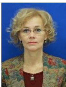
Ms Rozalia-Ibolya BIRÓ

Chair of the Committee for Foreign Affairs Group of the European People's Party (Christian Democrats) (EPP)