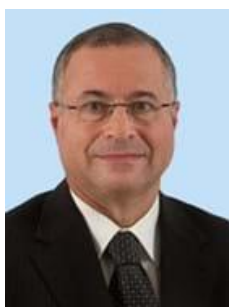
Mr Carmelo MIFSUD BONNICI

Member of the Foreign and European Affairs Committee Group of the European People's Party (Christian Democrats) (EPP)