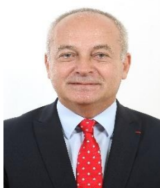
Mr Joël GUERRIAU

Head of delegation Vice – Chair of the Foreign Affairs, Defence and Armed Forces Committee Group of the Alliance of Liberals and Democrats for Europe (ALDE)