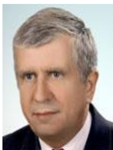
Mr Michal JACH

Head of delegation Chair of the National Defence Committee European Conservatives and Reformists Group (ECR)