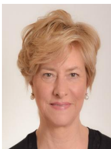
Ms Roberta PINOTTI

Head of delegation Chair of the Defence Committee Europe of Nations and Freedom Group (ENF)