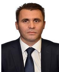
Mr Ejup ALIMİ

Member of the Committee on Defence and Security Group of the European People's Party (Christian Democrats) (EPP)