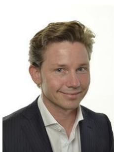
Mr Pål JONSON

Member of the Committee on Defence European Conservatives and Reformists Group (ECR)