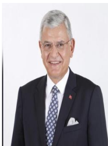
Mr Volkan BOZKIR

Grand National Assembly of Turkey / Grande Assemblée Nationale de Turquie / Türkiye Büyük Millet Meclisi