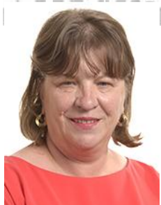
Ms Norica NICOLAI

Member of the Committee on Foreign Affairs Group of the European People's Party (Christian Democrats) (EPP)