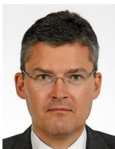
Mr Roderich KIESEWETTER

Deputy Member of Defence Committee Non-attached