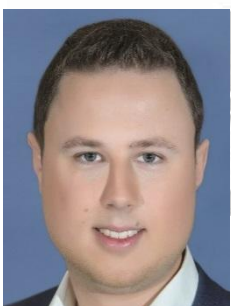
Mr Žan MAHNIČ

Member of the Committee on Foreign Policy Group of the European People's Party (Christian Democrats) (EPP)