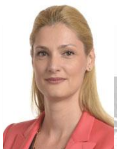
Ms Ramona Nicole MĂNESCU

Member of the Subcommittee on Security and Defence Substitute member of the Committee on Foreign Affairs Group of the Progressive Alliance of Socialists and Democrats (S&D)