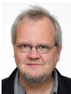
Mr Tobias PFLÜGER

Deputy Member of Foreign Affairs Committee and Member of Defence Committee Confederal group of the European United Left – Nordic Green Left (GUE/NGL)