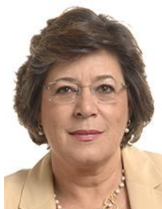
Ms Ana GOMES

Substitute member of the Committee on Foreign Affairs Group of the Progressive Alliance of Socialists and Democrats (S&D)