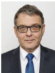
Mr Lubomír ZAORÁLEK

Head of delegation Chair of the Foreign Affairs Committee Group of the Progressive Alliance of Socialists and Democrats (S&D)