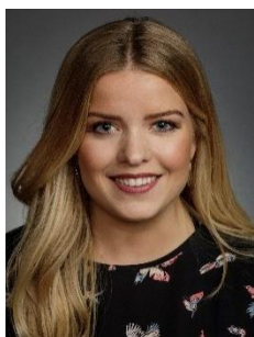
Ms Áslaug Arna SIGURBJÖRNSDÓTTIR

Chair of the Foreign Affairs Committee European Conservatives and Reformists Group (ECR)