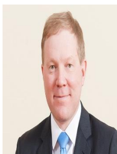
Mr Marko MIHKELSON

Head of delegation Chair of the Foreign Affairs Committee Group of the Alliance of Liberals and Democrats for Europe (ALDE)