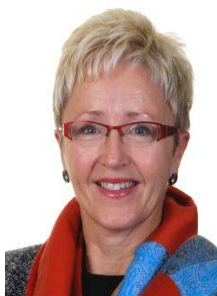
Ms Liv Signe NAVARSETE

Second Vice-Chair of the Standing Committee on Foreign Affairs and Defence Non-attached