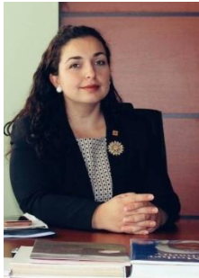
Ms Vjosa OSMANI SADRIU