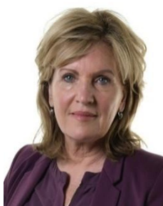
Ms Pia DIJKSTRA

House of Representatives / Chamber des représentants / Tweede Kamer der Staten-Generaal