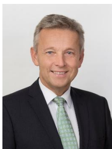
Mr Reinhold LOPATKA

Chair of the European Affairs Standing Sub-Committee