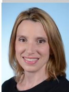
Ms Laetitia SAINT – PAUL

Member of the European Affairs Committee and Foreign Affairs Committee Non-attached